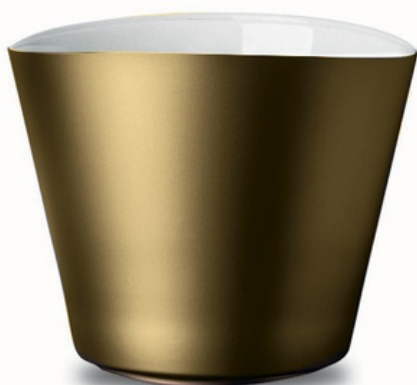
OC Porcellana Materic Gold