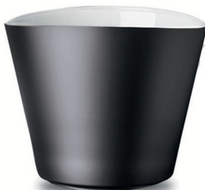
NC Porcellana Vulcan Grey