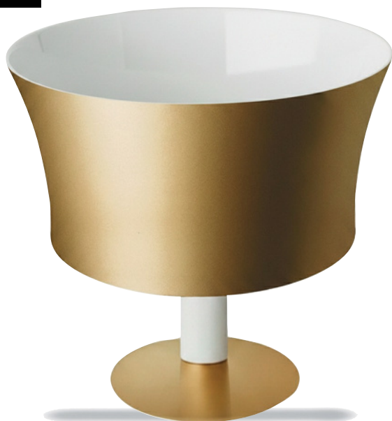
mm. 1,2 Champagnera 5 bott. c/pied. Giant Champagne bucket 5 bot. Seau à champagne p/5 bout. Champagner Bowl 5 Fläsche Cubo de champagne p/5 bot. Ø cm. 40 Ø 15 3/4" H cm. 38,5 H 15 1/6" lt. 15 gal. 4