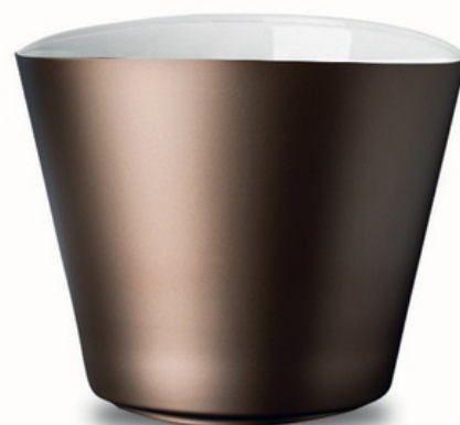
BC Porcellana Materic Bronze