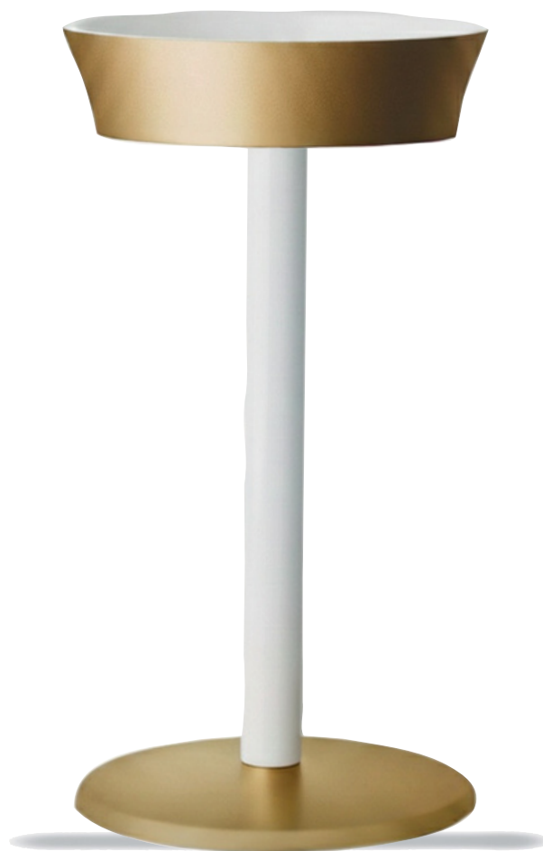
mm. 1,2 Colonna portabottiglie spumante Wine cooler stand Pied pour seau à champagne Weinkühlerständer Columna porta cubo champany H cm. 78 H 30 5/7"