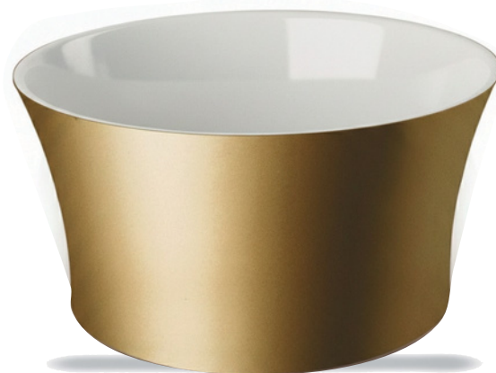
mm. 1,2 Champagnera 5 bott. s/pied. Giant Champagne bucket 5 bot. Seau à champagne p/5 bout. Champagner Bowl 5 Fläsche Cubo de champagne p/5 bot. Ø cm. 40 Ø 15 3/4" H cm. 21,8 H 8 3/5" lt. 15 gal. 4